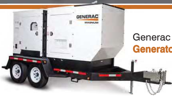
Generac / Magnum Portable Generators available from 8kW - 2000kW.