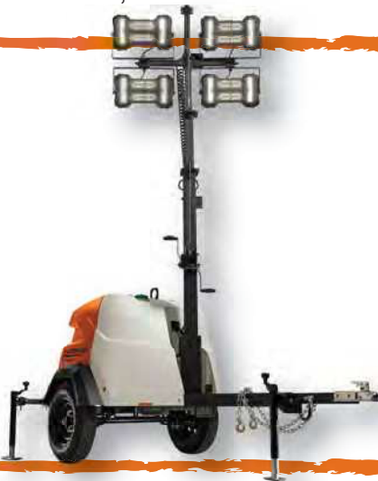
Light Towers available in multiple sizes & configurations. Choose from folding or vertical masts LED or metal halide lights & other options to meet your needs.