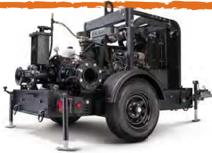
Dry & wet prime Pumps to get the job done. 80 GPM - 2,750 GPM.