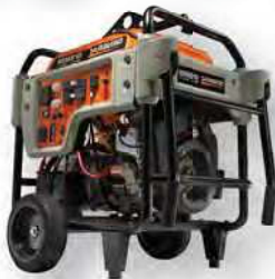
Rugged & Portable Generators from 1.8kW -17.5kW. Gasoline & Diesel models available.